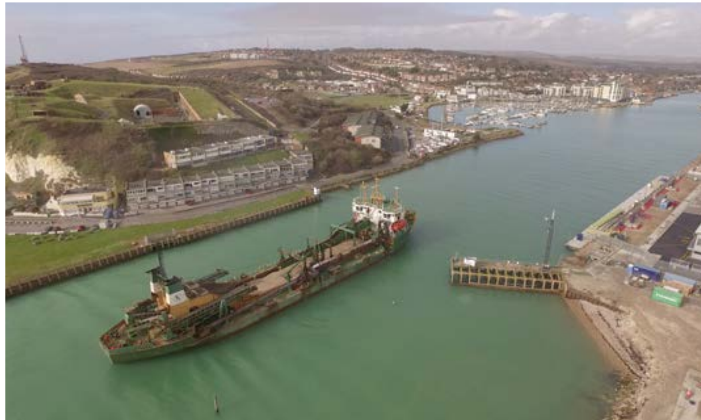
FIGURE 1 The trailer suction hopper dredger Britannia Beaver, operated by Britannia Aggregates Ltd, entering the port of Newhaven, East Sussex.

marine mineral extraction on almost the entirety of the continental shelf of England, Wales and Northern Ireland, continue to have a role in marine aggregate extraction through the award of commercial licences and such