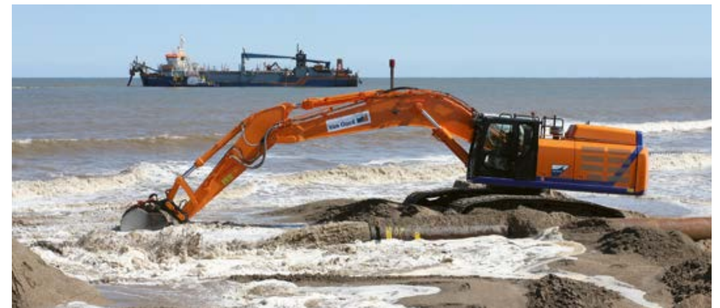
FIGURE 4 Lincshire Beach Nourishment scheme being undertaken by Van Oord.

While each application is reviewed on its own merit, aggregate dredging projects frequently require Water Framework Directive (WFD) assessment, along with Habitats Regulations Assessment (HRA) and Marine Conservation