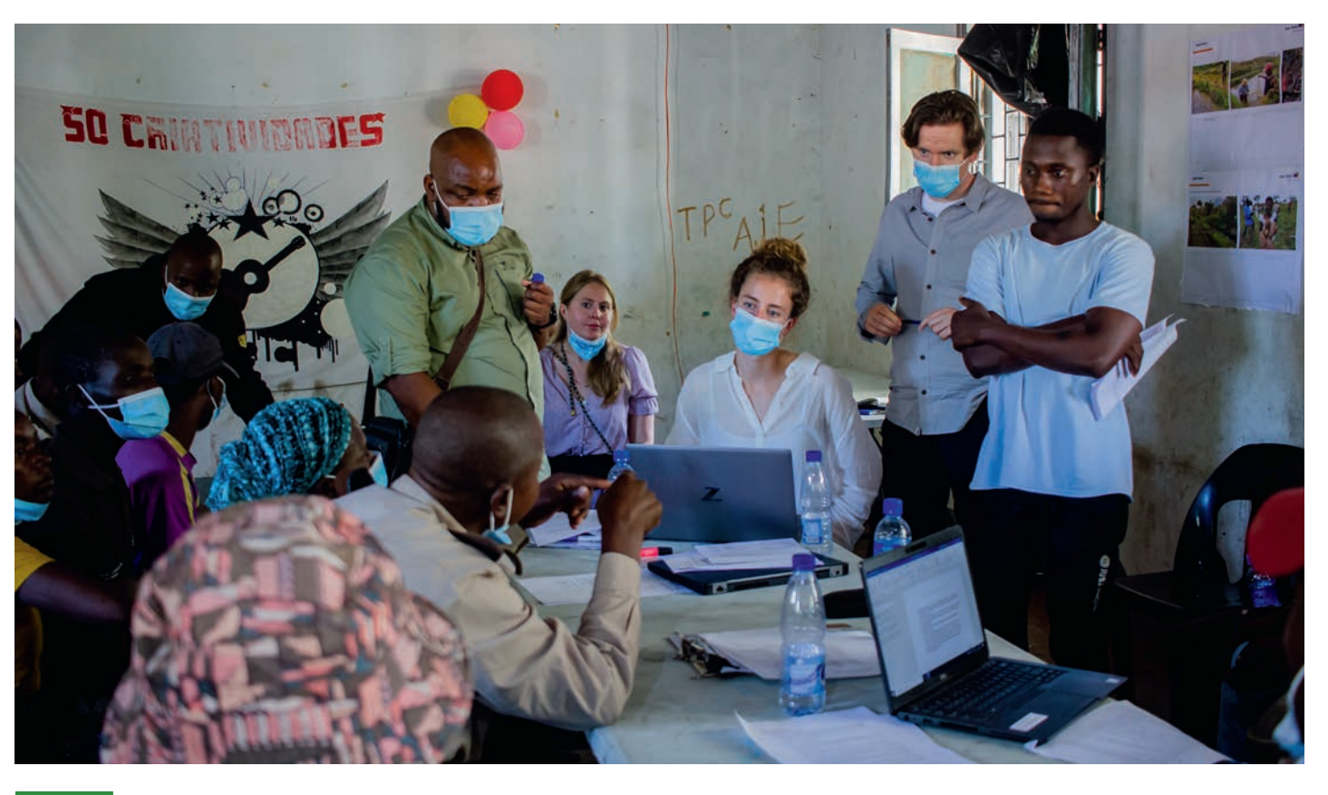
FIGURE 6 Community meeting (Mozambique).

An intended effect of our decision to make the Climate Risk Overview freely and publicly available is that everyone can and should use it, not just the thematic or policy experts in our field. The Climate Risk Overview proved already to be a tool that is so easy to use that it is a powerful tool for the public to explore. We have used it in sessions with both our clients and with students. We hope it will raise awareness for the great challenges that society faces due to climate change and that it might unlock unexpected opportunities.