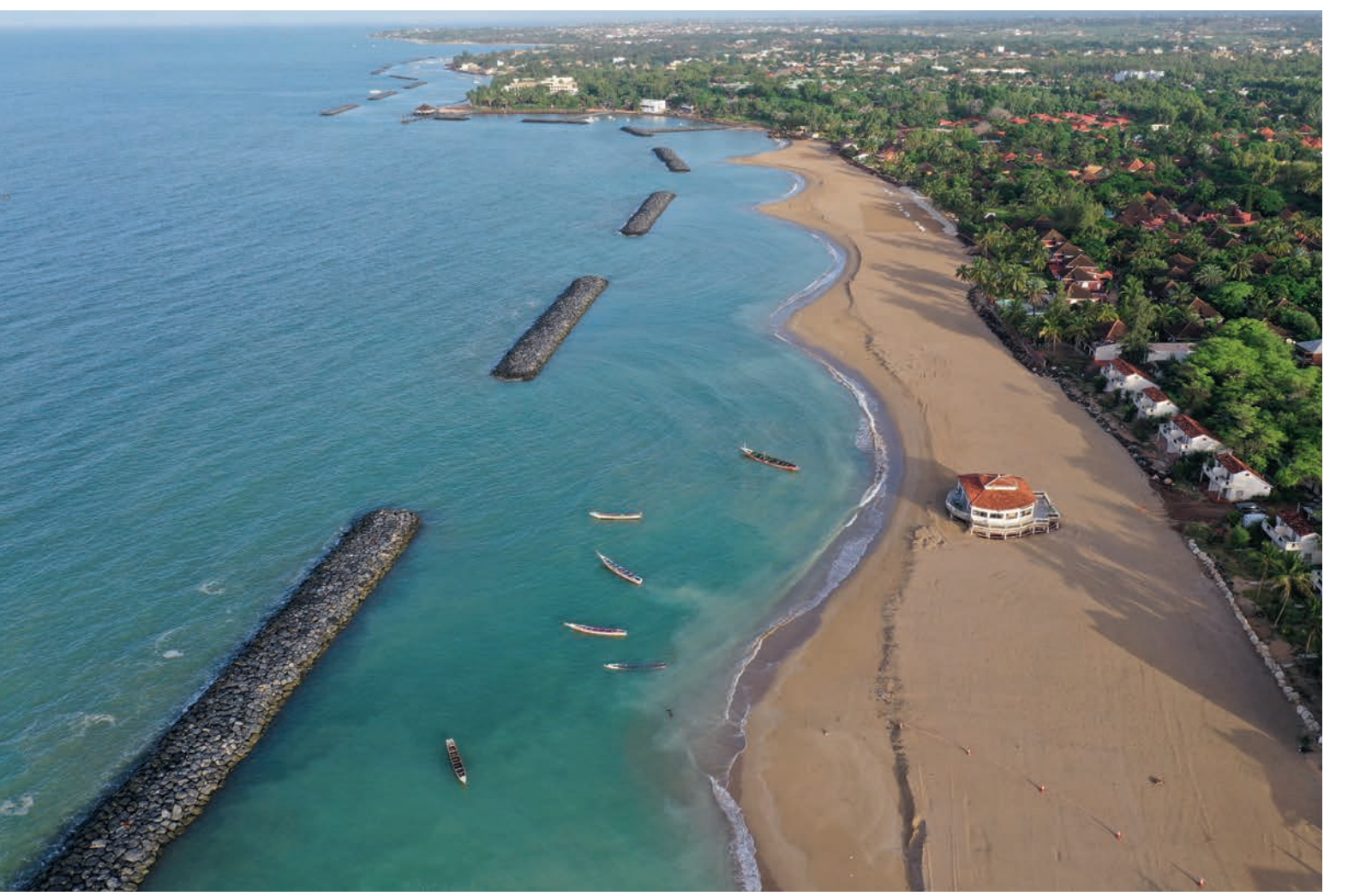
FIGURE 5 Saly, Senegal.

Another example is Saly in Senegal (Figure 5). where the beach had disappeared completely. Houses had been taken by the sea and the tourism industry had completely collapsed. We created a coastal defence over 4 kilometres by protecting the coastline with offshore breakwaters and a beach restoration. As a result, the local fishers now have access to the sea and can store their boats safely in protected calm areas created by the breakwaters. The local economy has recovered as beach tourism started to flourish again.