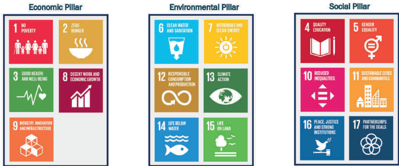
FIGURE 1 The UN's 17 Sustainable Development Goals (SDGs) arranged into the three sustainability pillars.

questions: 1) What are the sustainable project valuation methods currently available; and 2) Which methods are the most suitable for evaluating externalities in maritime infrastructure projects?