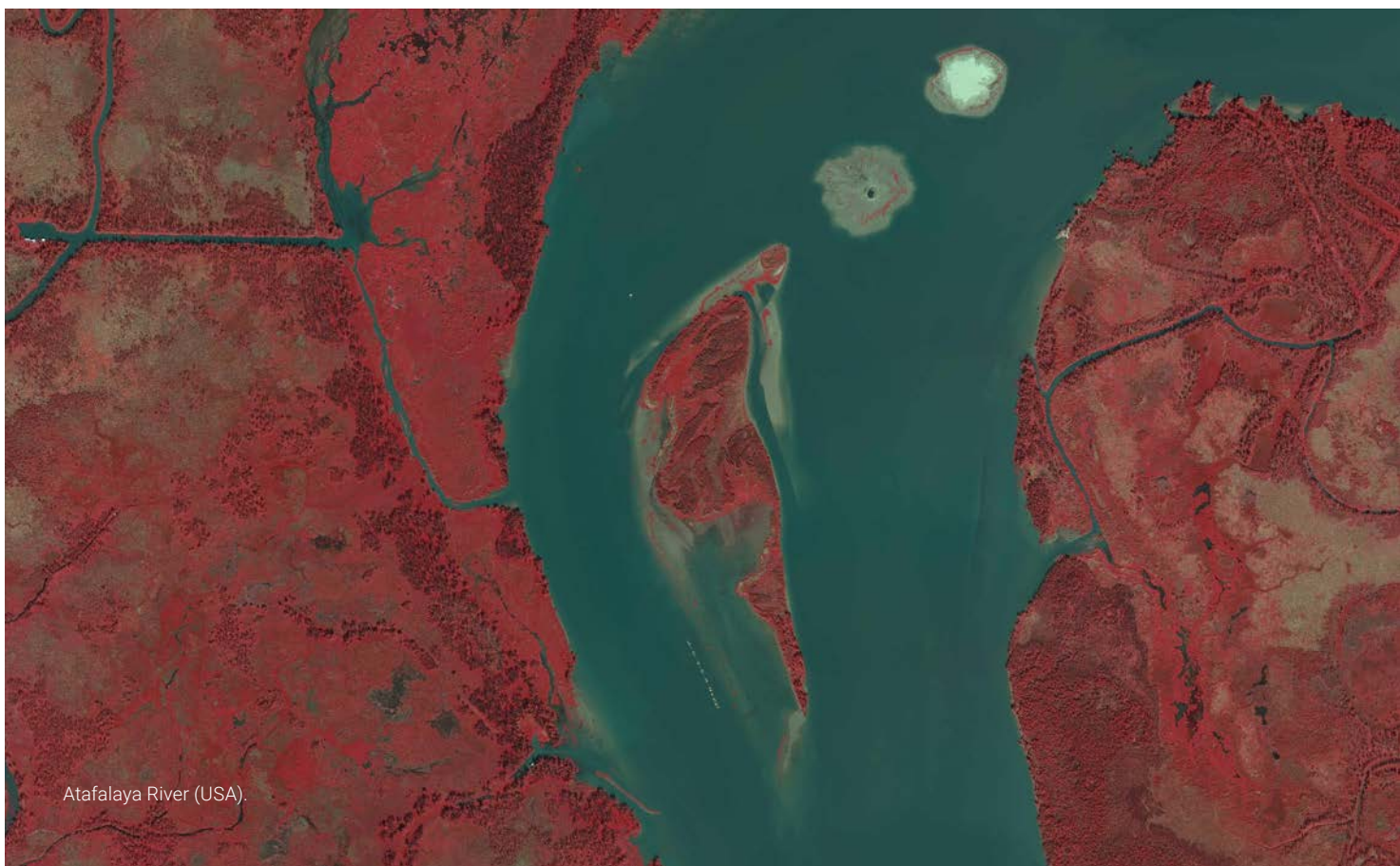
Atafalaya River (USA).

These stakeholder impacts can be mitigated with the right regulations and ESIA procedure in place. In most projects, these regulations and procedures are beyond the scope and responsibility of contractors, but they can exercise due diligence and leverage and assist project owners with that responsibility.