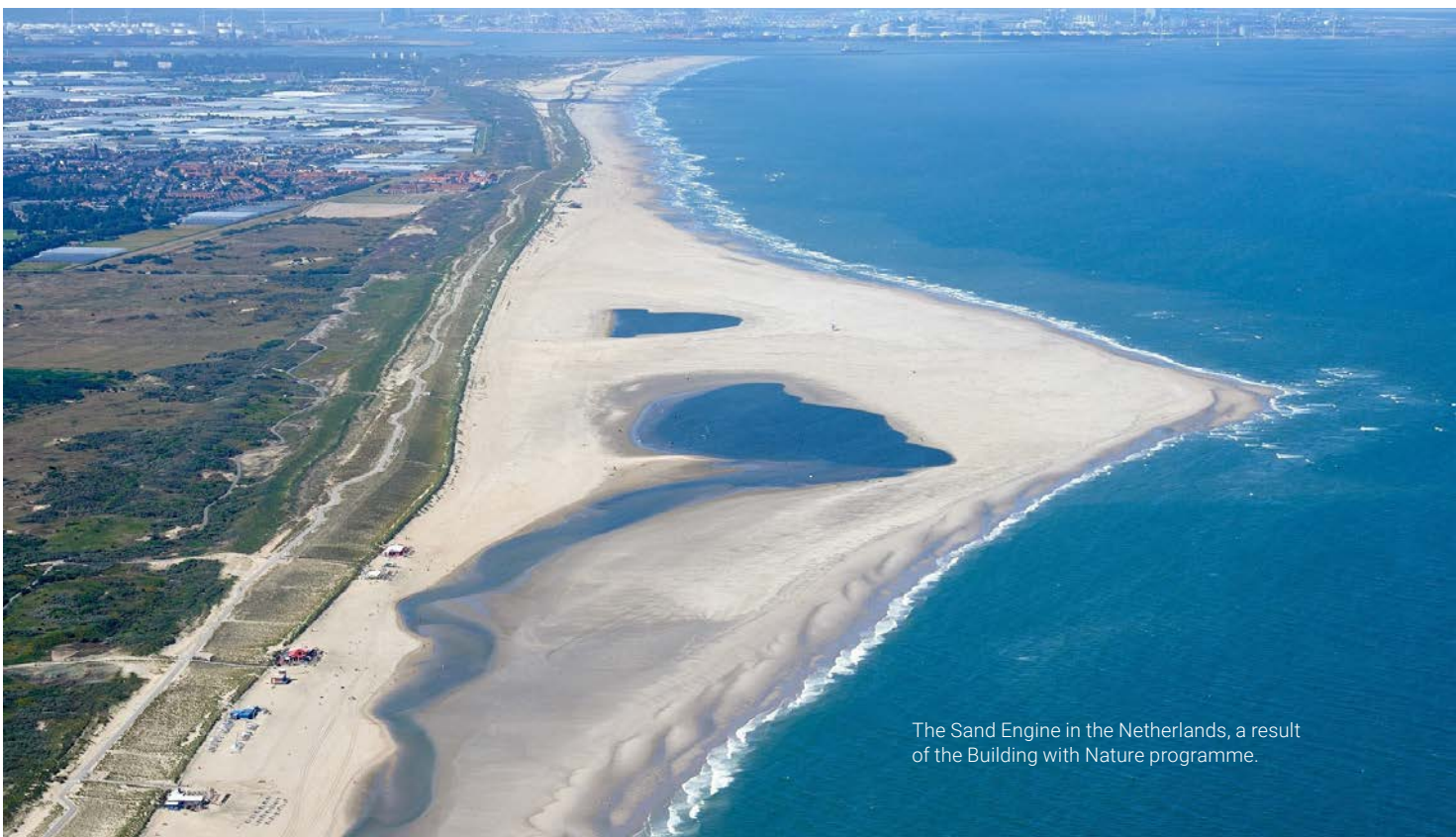
The Sand Engine in the Netherlands, a result of the Building with Nature programme.

The ability to project long-term performance and effects was complicated by uncertainties. Hard structures, separating fresh and salt water and wet and dry areas (e.g. revetments, breakwaters, dams, walls, dikes etc.), were common engineering solutions, in order to manage the hydraulics. Rivers were trained and dams were built to facilitate navigation, manage high water and flooding, and generate energy. In many cases these solutions have disrupted sediment processes, which have given rise to long-term effects and current, ongoing engineering and ecological challenges (e.g. shrinking reservoir capacity due to sedimentation, shoreline erosion, loss of coastal landscapes and habitats, etc.). Past engineering projects have certainly delivered