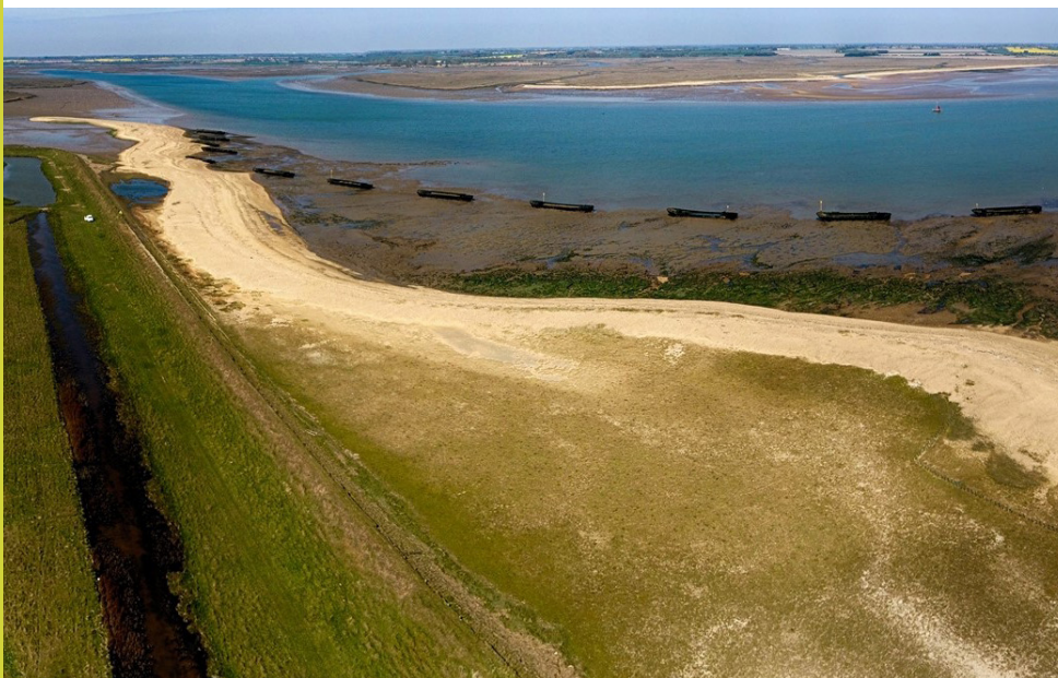
Change in coastal elevation at Horsey Island beneficial use sites between 1999 and 2015 (ABP mer, 2016, using UK Environment LiDAR data from 1999 and 2015).

Taking the long view – Water infrastructure projects, due to the amount of investment they require, are long-term propositions. While the state of scientific and engineering practice continues to advance, there will continue to be uncertainties regarding the behaviour of natural and engineered systems over the long-term. Nevertheless, pursuit of sustainable infrastructure requires taking a broad and long-term view of a project’s life cycle. Taking this broad, system view is necessary in order to determine whether the project can be expected to be sustainable over the long term, i.e. that the total value of the project over the three pillars of sustainability is judged to be sufficient in relation to the investment required to create that value. Performing such sustainability analyses could mean that some proposed projects will not be built, or that existing projects will be decommissioned and abandoned in favour of more sustainable projects. Some ports or waterways, for example, which cannot be efficiently sustained over time due to the effects of physical processes, coastal conditions, sedimentation, environmental impacts, etc., would receive reduced levels of investment in favour of ports and waterways situated in a more sustainable condition. When investment decisions are being made on the basis of the overall sustainability of the project, then we will know that the concept of sustainability has been successfully incorporated into the governance of infrastructure systems.