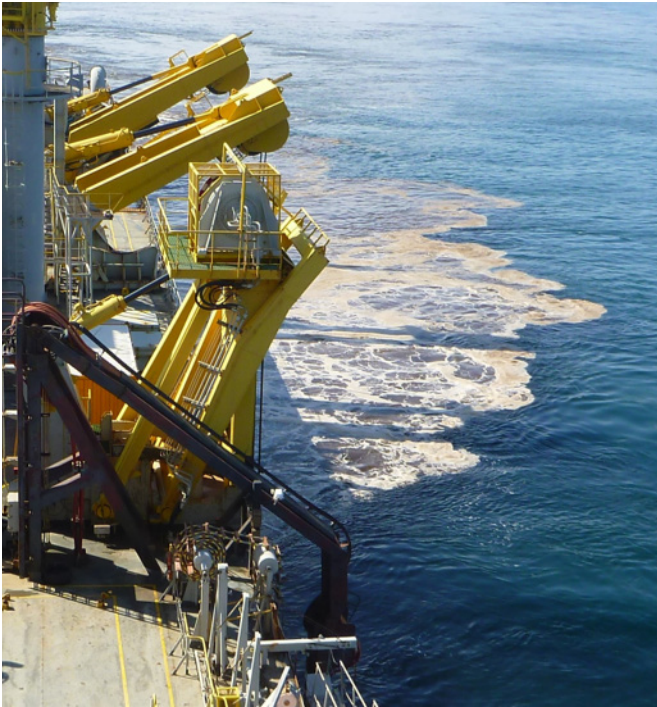
Effect of environmental valve; left valve off, right valve active