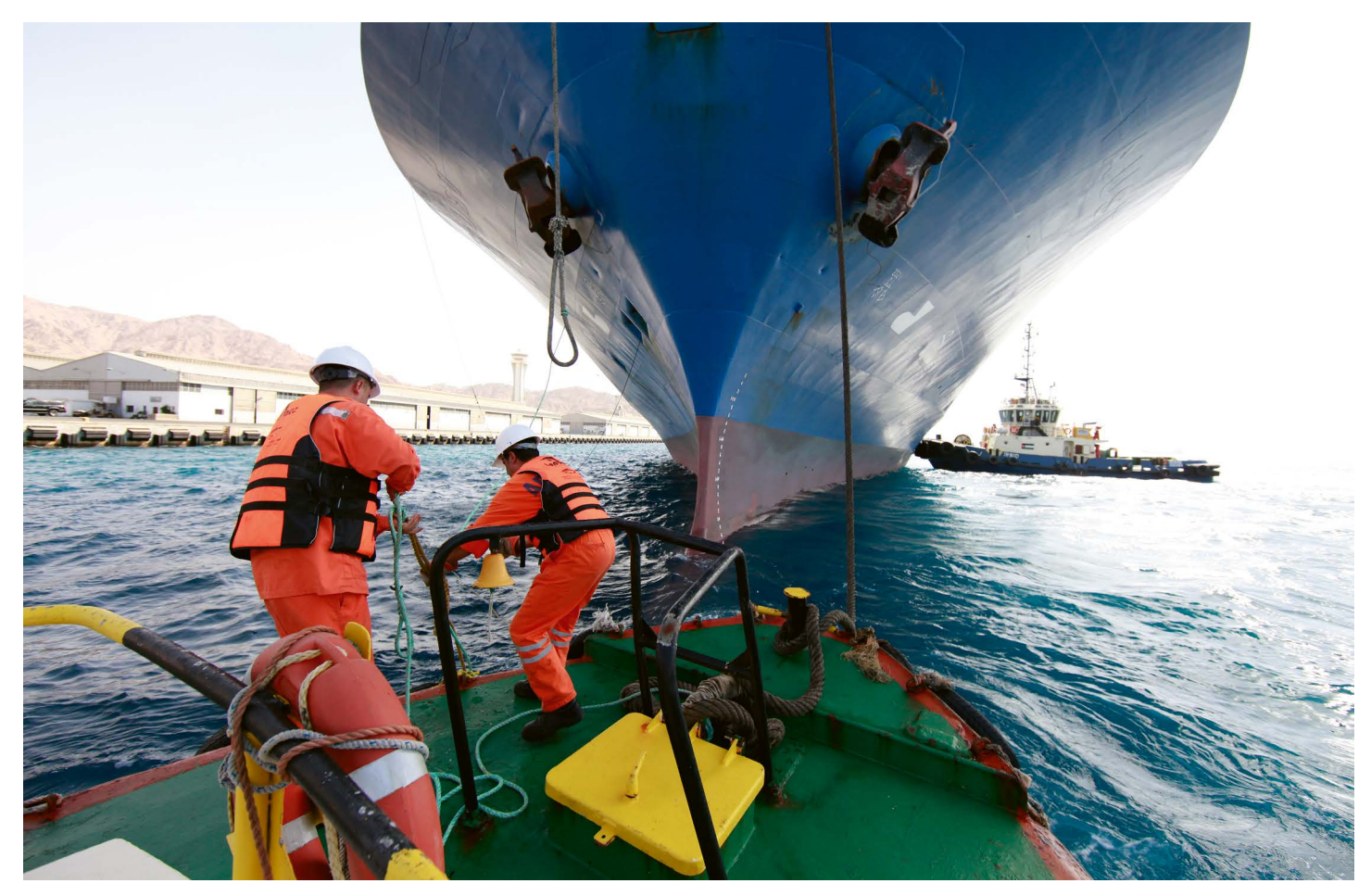
Figure 3. A mooring operation being undertaken by crew in a safe and efficient manner

The bottom part of the pyramid is considered to be "active" or "participative" learning. In addition to absorbing information, the learner is also a sharer of information.