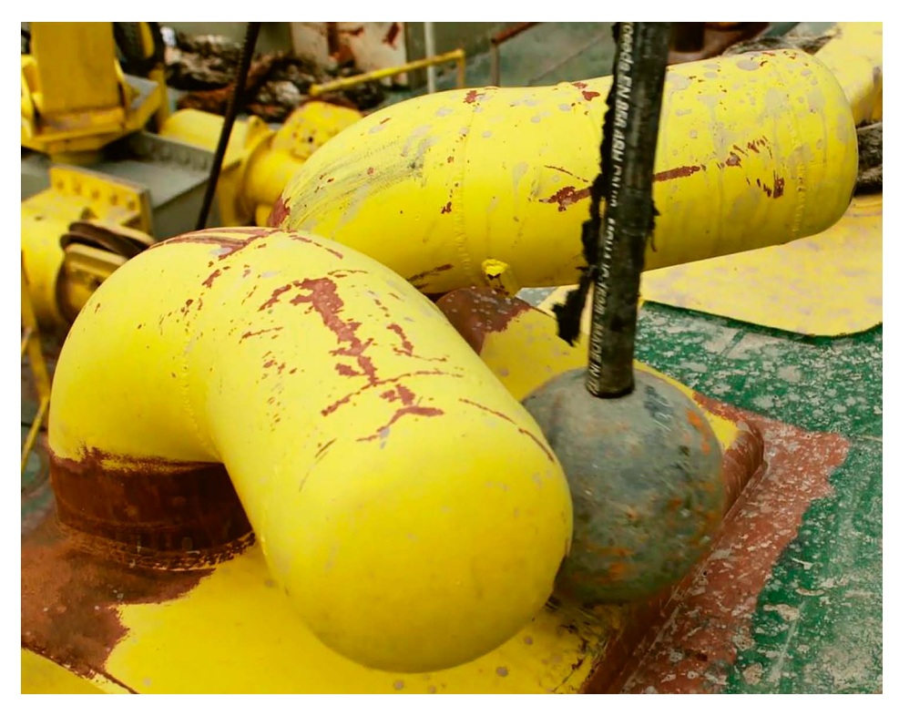
Figure 2. A V-shaped mooring bollard