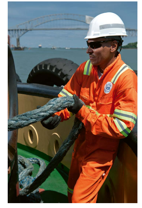
Figure 5. A crew member utilising a mooring rope.

Automation of mooring operations will also continue to developed. The future of these automated mooring systems is positive but at the moment they cannot (yet) handle all hull shapes. Furthermore, whether automated vessels are a possibility is yet to be seen.