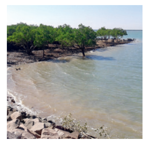
Figure 4. An exploratory survey into the recovery of mangrove forests in Indonesia.

Steps are currently being taken within BwN to develop a design tool that focusses on these buttons. To that end, a partnership has been formed between two dredging companies (Boskalis and Van Oord), NGOs (The North Sea Foundation and the Wetlands International Foundation), engineering and consulting firms (Arcadis, Royal HaskoningDHV and Witteveen+Bos) and Deltares, a Dutch institute for applied research in the field of water, subsurface and infrastructure. The goal is to be able to develop and construct maritime engineering projects that leave a much smaller CO<sub>2</sub> footprint over their entire lifecycle than