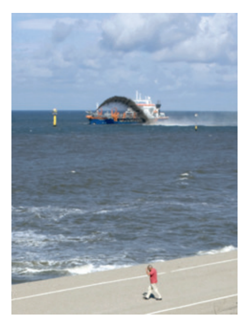
Figure 2. Twenty million cubic metres of sand were placed on the Dutch coastline to strengthen the Hondsbossche and Pettemer Sea Defences in northwestern Holland. The sailing distance to and from the extraction site must also be considered in evaluating the C0, footprint.

that are released from deeper sediment layers during dredging are no longer degradable.