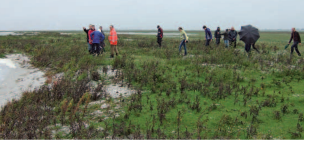
Figure 4. The Community of Practice (CoP) on a field visit to the coast in the rain.

Of course, there were minor contextual issues to settle. For instance, with the recreation, hotel and catering sector. One of the issues was that the beach width should not become too large. If the sea is too far away, that would be bad for business. A somewhat tougher issue was introduced by a group of kite surfers, who perceived a regulatory threat: If the Sand Engine indeed creates additional nature, the area may be designated as a nature conservation area and then be closed for other activities. This issue also caused concern amongst others, because the dynamic nature of the Sand Engine totally misfits static conservation requirements. After careful consideration a decision was taken that the Sand Engine area would be explicitly separated from a nearby Natura 2000 area.