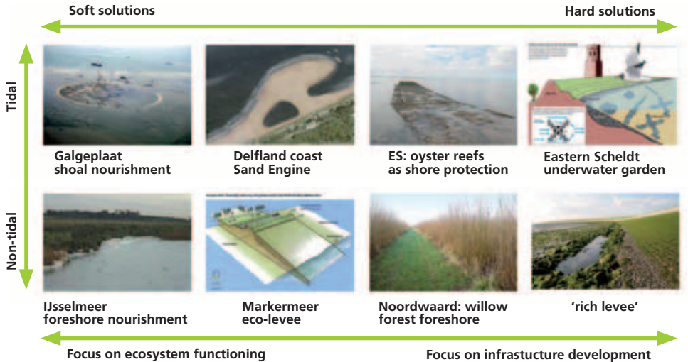
Figure 1. Examples and positioning of Building with Nature in tidal and non-tidal environments and on a scale of human versus ecosystem dominance.

The coast of the Frisian Usselmeer Lake has adapted a relatively constant level since its closure in 1932. If the lake level were to rise at once to the proposed height, valuable historic cities bordering the lake would face flooding threats. Industrial sites, recreational facilities and valuable natural areas that have developed since the closure would disappear. Moreover, such a rise of water level would affect the groundwater flows and drainage of the surrounding polders. And finally, people felt a sense of injustice, as the costs of waterlevel rises would bear on the regions of Frisian coastline whilst the benefits of more freshwater would go to other parts of the country.