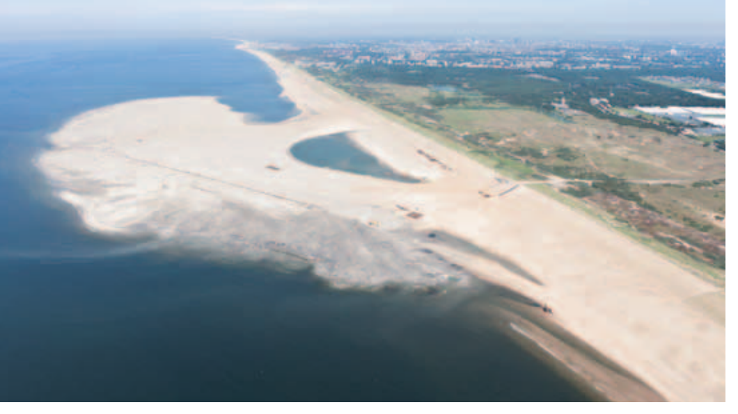
Figure 5. Delfland Sand Engine on June 14, 2011 showing the progress of construction of the peninsula which will extend about 1 km into the North Sea.

ideas into policy. The mindsets of people are not focused on what can be achieved by an innovation. For most people – except perhaps some visionaries – what is seems to be more prominent in their mindsets than what can be . The simple governance lesson is of course that "building with nature" solutions should be connected to existing problems as they are perceived in the area. Only then can the actors' perceptions be influenced and stakeholders may be willing to connect their stakes and resources to such an initiative.