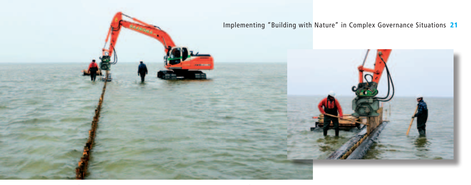
Figure 3. As part of the pilot study on the Frisian IJsselmeer coast, a semi-permeable row of poles was constructed. This row must mitigate wave energy so that sand can deposit at the location of the Sand Engine. Insert, close-up of the poles being placed.

densely populated area of the Netherlands, experienced a considerable shortage of these amenities. A secondary aim was to innovate and to develop knowledge (Van Dalfsen and Aarninkhof, 2009).