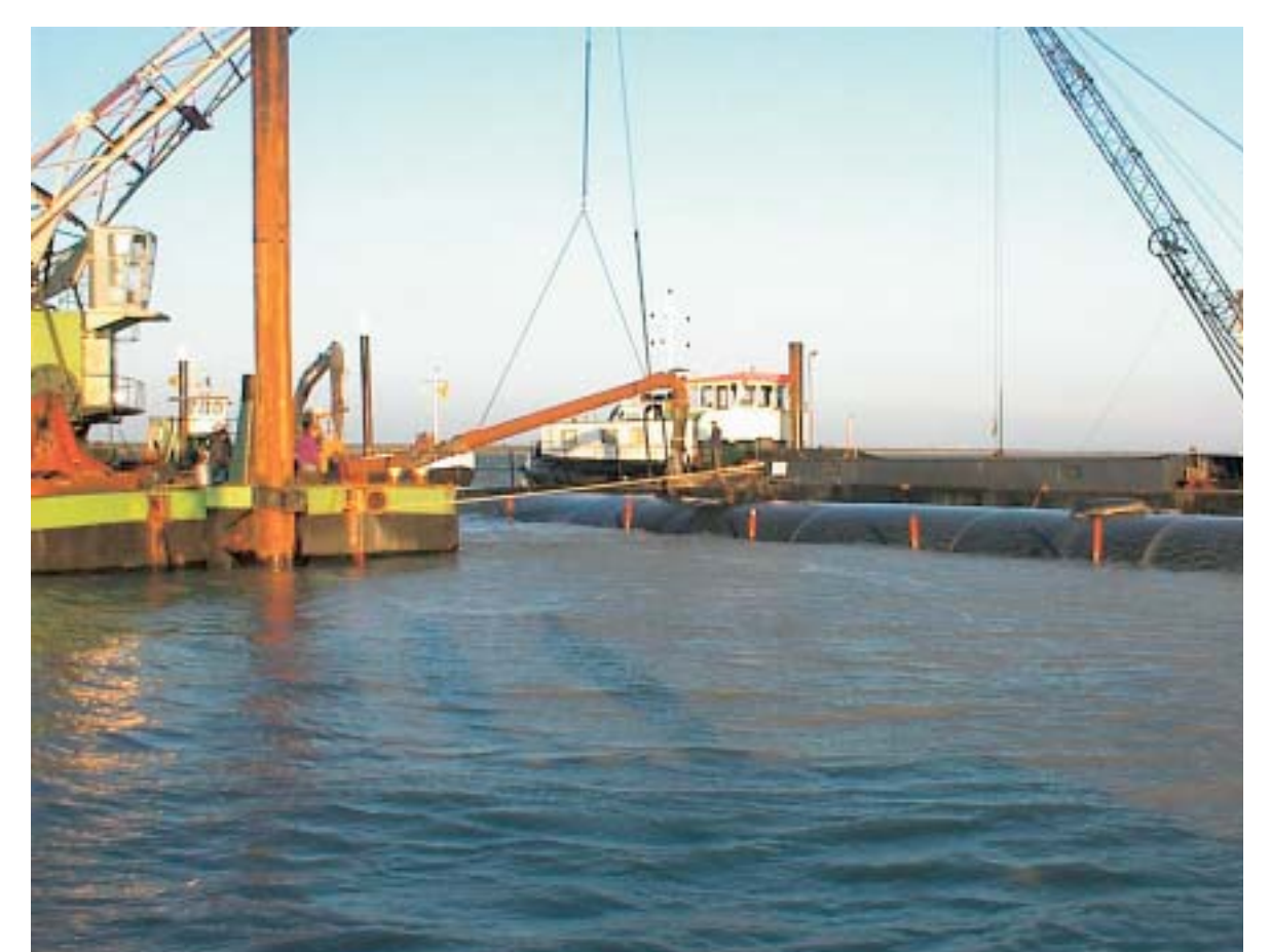
Figure 2. The geotubes made of geotextiles are filled with a water-sand mixture.

This technique involves the geotextile being put in place from a special pontoon using a roller system. The location is closely monitored to an accuracy of 10 cm using the Digital Global Position System (DGPS).