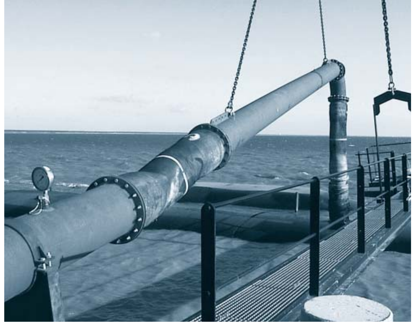
Figure 3. The connection point of the filling pipe and the geotube.

During positioning, the 15 m wide geotextile is kept firmly on the bed by mechanical means using a pressure roller. Two crane ships sailing along together place a 10-60 kg layer of quarry stone on either side of the geotextile. Approximately 4000 m<sup>2</sup> of seabed protection is put in place daily in this way.