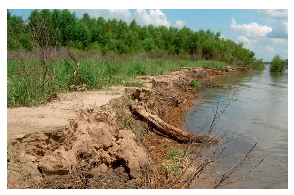
Figure 4. The island's cut bank bordering the Atchafalaya River reveals a nearly 2-foot layer of sediment deposited during the 2011 spring flood. Dredged material feeder mounds placed upstream are contributing to the deposition of this material. Decaying vegetation is visible below the newly deposited sediments.

earned Bachelor's and Master's degrees in Fisheries Biology from Louisiana State University in 1997 and 1999, respectively. He is an Environmental Resources Specialist at the USACE. New Orleans District, and oversees environmental aspects of the District's 70 million cubic yard (54 million cubic metre) per annum maintenance dredging programme.