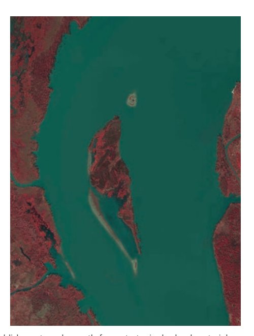
Figure 1. Landsat imagery displaying island location of dredged material (DM) placement and subsequent formation, establishment, and growth from strategic dredged material placement from December 2010, 2011, 2012.