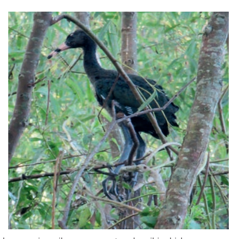
Figure 6. A diverse assemblage of native plant and animal life has colonised the island. Left to right, A juvenile tricolored heron, a juvenile snowy egret and an ibis chick were observed in nests on the island during nesting season (July 2014).