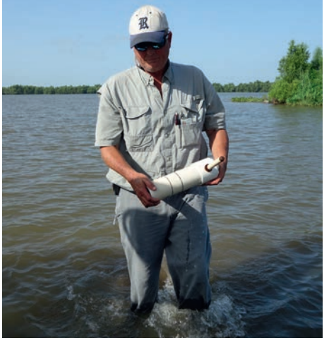
Figure 5. Left, The infaunal community sampling locations at Horseshoe Bend Island. Right, Infaunal sampling utilised a 7.5 cm coring device.