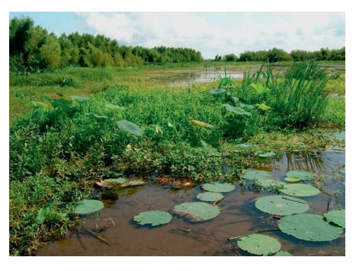
Figure 7. Variation in surface elevation of the island supports a mixture of habitats, including ponded areas, emergent wetlands, and forested wetlands that are all influenced to some degree by river stage and duration of flooding. Far left, American lotus (Nelumbo lutea) flowering in one of the island's low-lying pools.

Horseshoe Bend Island also supports more invertebrate abundance and diversity than natural islands in the region that lack the emergent aquatic bed landforms resulting from the strategic placement of dredged materials. Finally, the soils at the Horseshoe Bend Island display a capacity to sequester nutrients and other compounds and perform water quality functions at levels comparable to natural wetlands in the region.